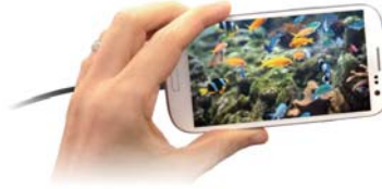
Connect smart phone with USB cable (Micro 5pin)