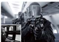
SWAT / Military / Counter Terrorism