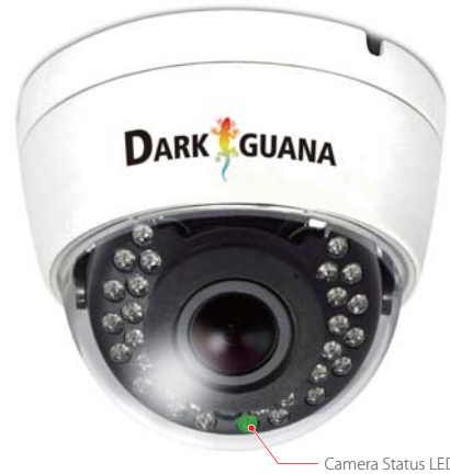
Camera Status LED