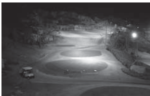
[ General Camera ]