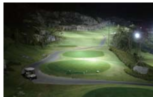
[ Dark Iguana Camera ]