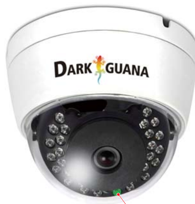
Camera Status LED