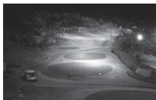
[ General Camera ]